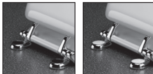
CHROME OR WHITE HINGE CAPS